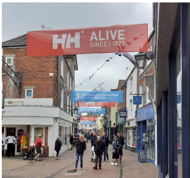
Image of our High Street, displaying brightly coloured flags, banners and bunting provided by Cowes Business Association, local businesses and Cowes Town Council.

As we look forward to a busy summer season, I wish you a happy and healthy summer and the hope that we continue to recover from the very challenging times we have experienced throughout the pandemic.